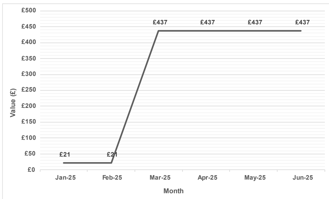
Graph 3 – Outstanding Debts Over 120 Days – January to June 2025